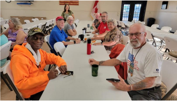
Gathering in the Clubhouse