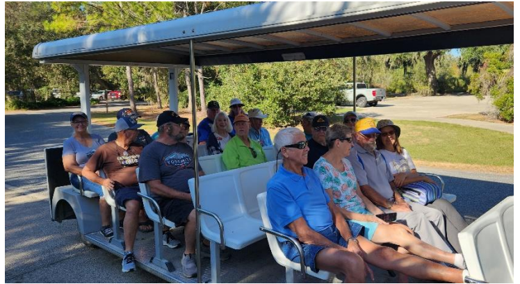
Circle B Bar Preserve Tram Tour in Lakeland, FL