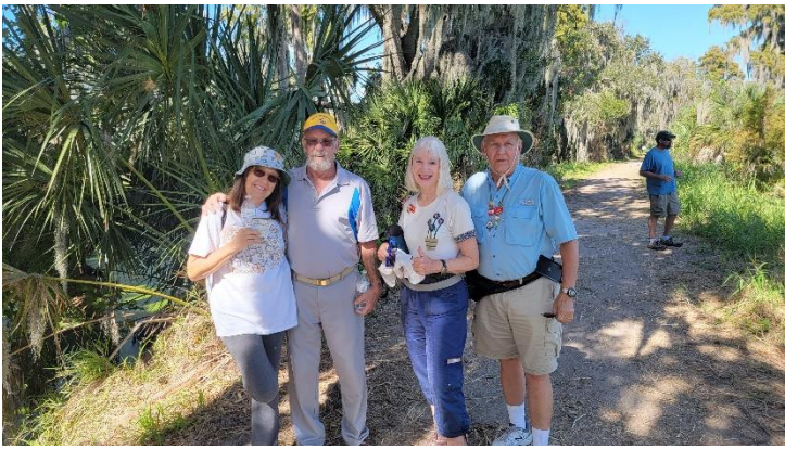
Sens & Lunde's Hiking at Circle B Bar Preserve