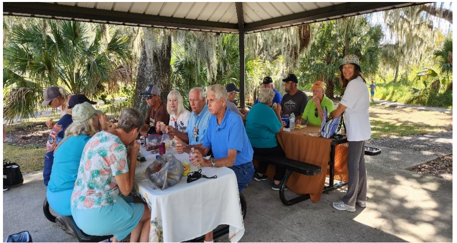
Picnic at Preserve after Tram Tour